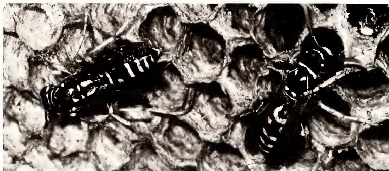
Figure 1. Females of Polistes dominulus at a nest in Saanich, BC, 30 September 2004.